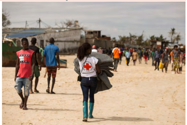
CVM volunteer supporting with distributions in cyclone affected Beira, Mozambique

24 March 2019: IFRC issues a Revised Emergency Appeal for 31 million Swiss francs for 200,000 people for 24 months.